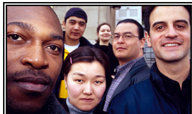
Multi-ethnic and multi-lingual

We have also cultivated relationships with other multicultural radio stations all across the U.S.