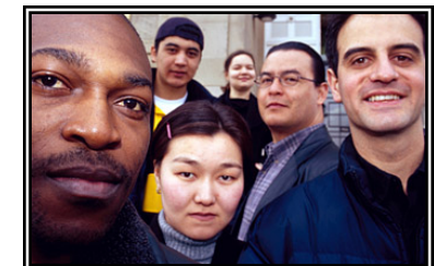
Multi-ethnic and multi-lingual