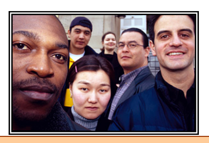
Multi-ethnic and multi-lingual